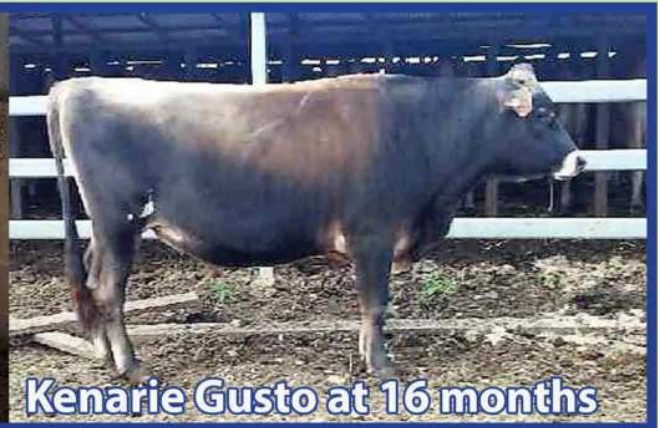
Kenarie Gusto at 16 months

Dam has produced 17,553 lbs 6.05% 1,063 F 4.63% 813 P in 305 days