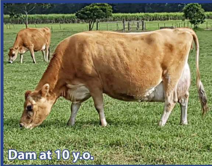
Dam at 10 y.o.