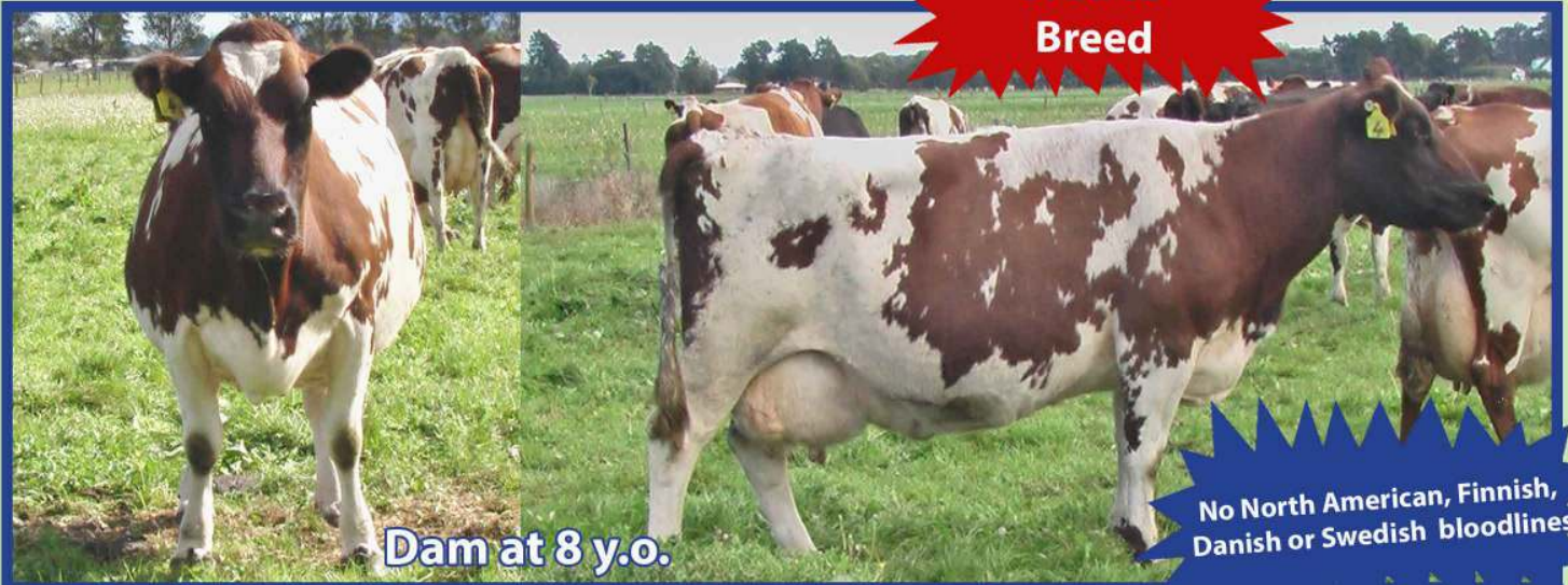
Dam at 8 y.o.

No North American, Finnish, Danish or Swedish bloodlines